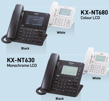
KX-NT680 Colour LCD