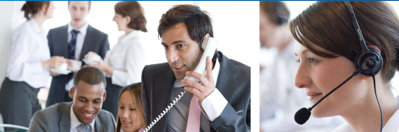
VERTICAL SOLUTIONS - SALES PROFESSIONALS