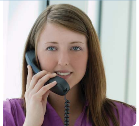
VERTICAL SOLUTIONS - REAL ESTATE